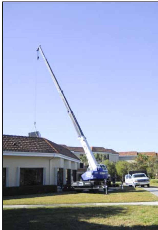
2 New AC Units for the Crystal Dining Room and 1 for Cafe