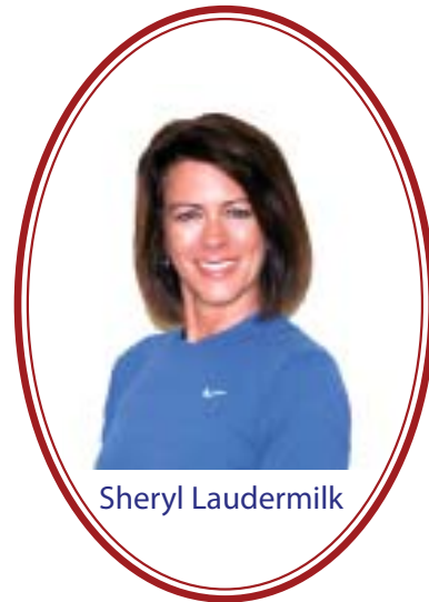
Sheryl Lauder milk